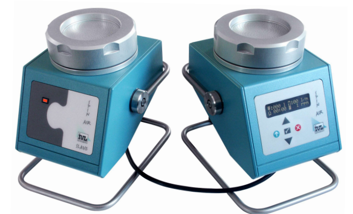
Spin Air Slave