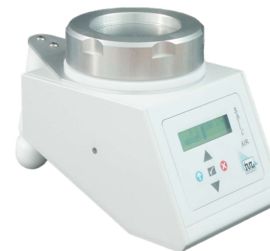
Spin Air Basic