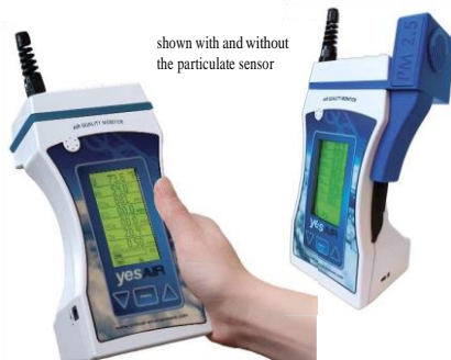
shown with and without the particulate sensor

The YESAIR is a battery powered, portable air quality detection and data logging instrument designed for intermittent or continuous air quality monitoring.