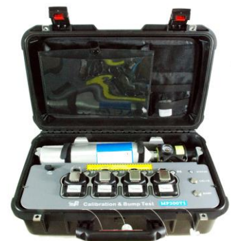
CaliCase Docking Station