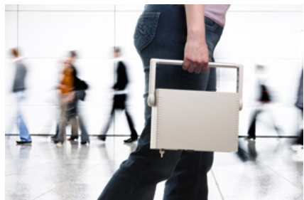
YES Plus LGA (picture above) is housed in a rugged ABS enclosure with swivel handle to act as a stand support or for carrying the instrument.